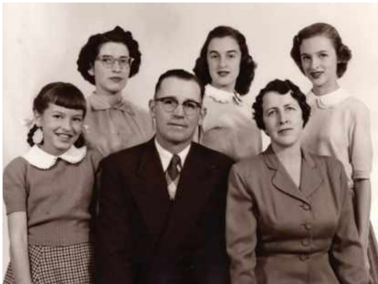
My parents and sisters