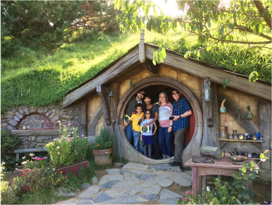
Hobbiton New Zealand