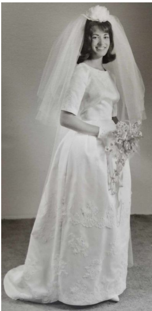
My Wedding Dress 1964