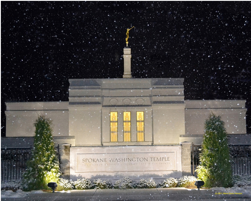
Spokane Washington Temple