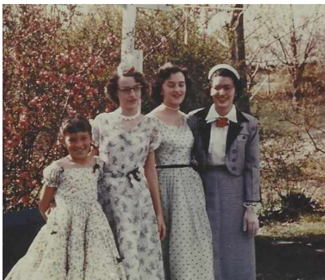
Me and my sisters in our Easter dresses.