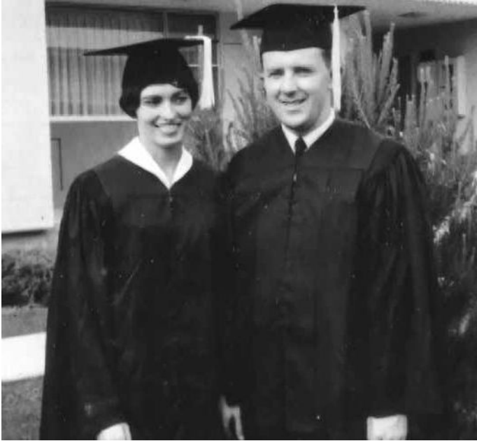
BYU Graduation Day 1966