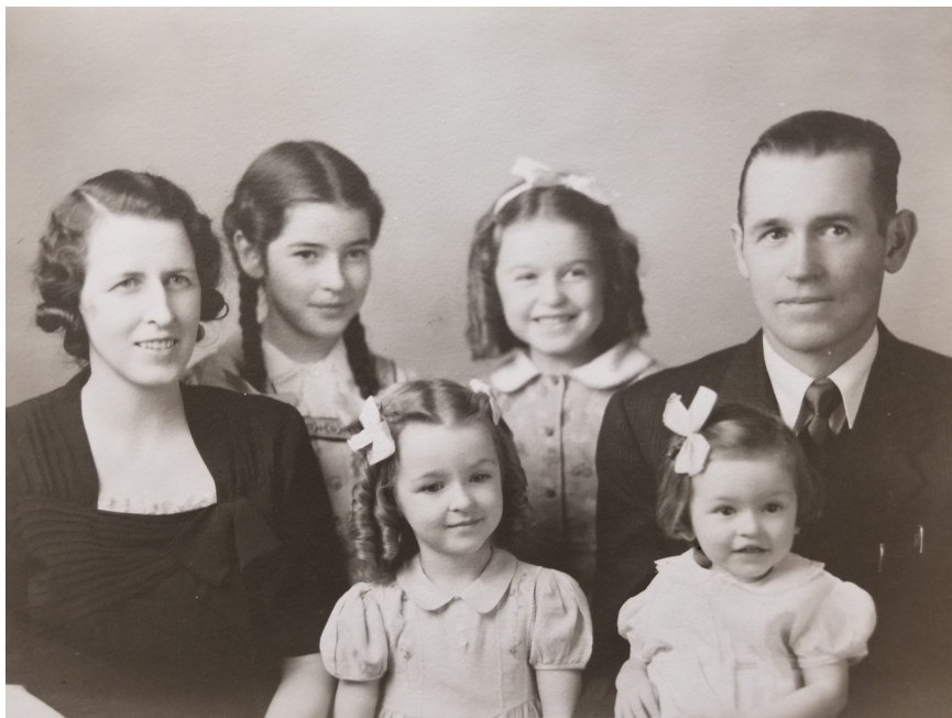
Family Photo about 1945