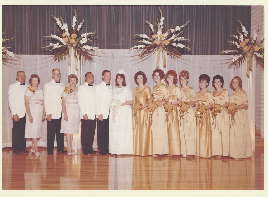
Our reception line