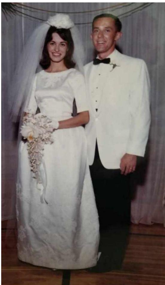
August 24, 1964