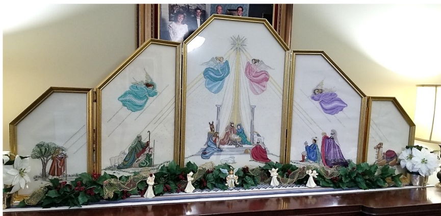
Counted cross nativity that I embroidered.