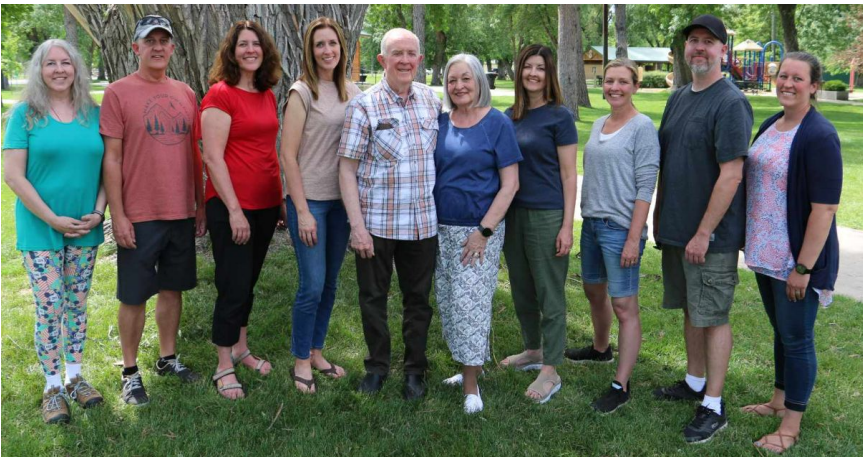
Our children 2022