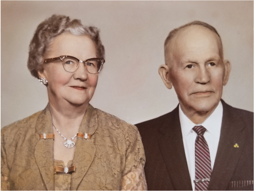
My Grandparents on their Golden Wedding Anniversary