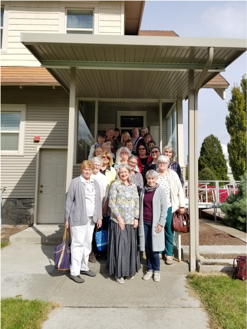
Spokane Valley Company of the Daughters of the Utah Pioneers Fall Social at the Bing Crosby House in Spokane, Washington. I was Company President. I am in front in the grey skirt.