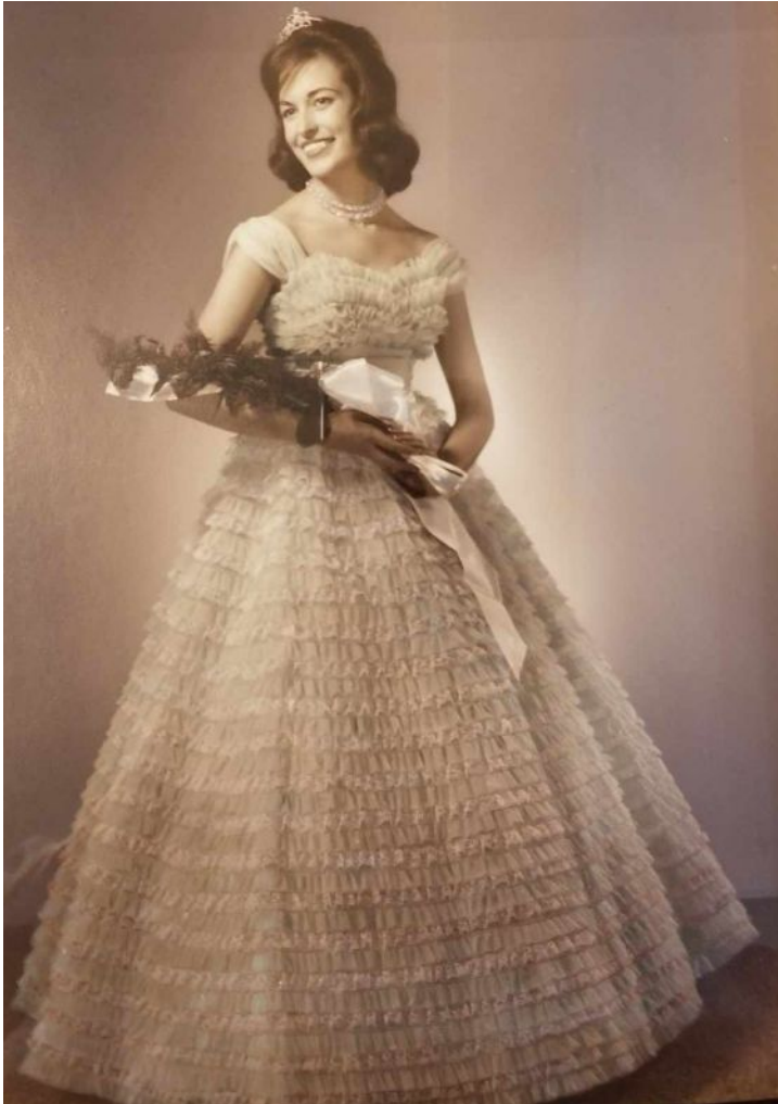
Strawberry Days Queen. I won the town beauty pageant the year I graduated. 1962