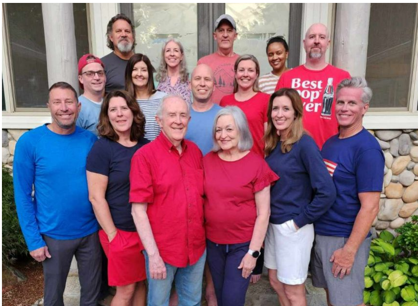
Our children and spouses 2023