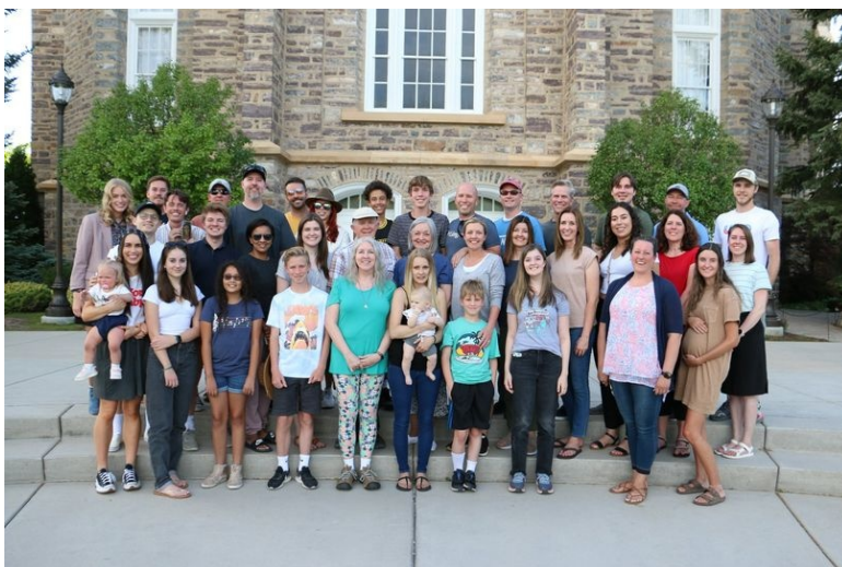
Extended Family 2022